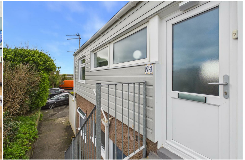
Chyreene Court, Riviere Towans, Phillack, TR27 5AF